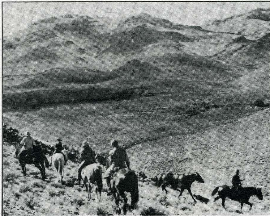
Idaho Pack Trip, 1940.

The Hemingway Society & The University of Idaho